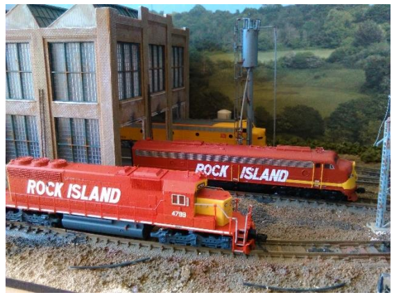
Rock Island red (Chris White)

These duly arrived, so I set to with the towers which were very fiddly, with many small parts, I do wish I had the fingers of a very small child, the towers were eventually finished, painted and weathered, the sand hut and drier was a lot easier to do.