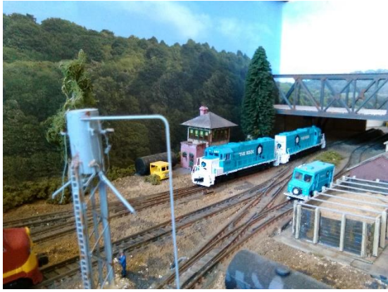
Hogs Hill sand towers (Chris White)

Most of the structures were in place, but it was awaiting the sand towers and some figures.