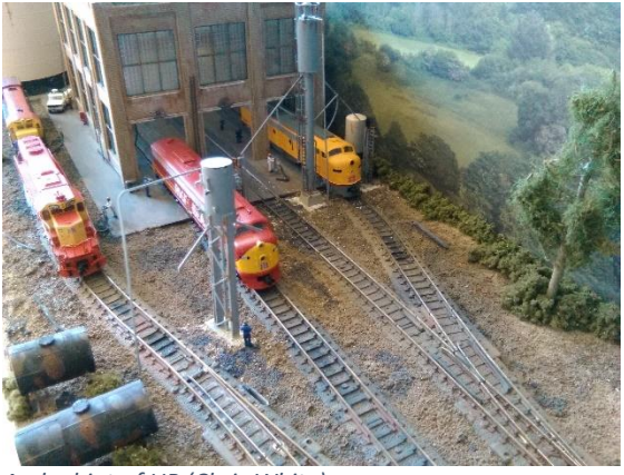
And a hint of UP (Chris White)

I did do an extra with the sand hut and dryer. I put them on a 2mm plasticard base with a paved surround to hide the base. I dug out the ballast areas around all the bases of the towers and driers so the items could be seated. A small job I must do is to add more ballast to cover them. The whole area was weathered more to make it grubbier.