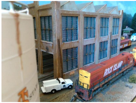
Grime! (Chris White)

I did do an extra with the sand hut and dryer. I put them on a 2mm plasticard base with a paved surround to hide the base. I dug out the ballast areas around all the bases of the towers and driers so the items could be seated. A small job I must do is to add more ballast to cover them. The whole area was weathered more to make it grubbier.