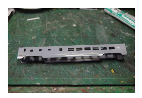
Well, I thought that too!

This completes the body modifications. The next photo shows it primed then rubbed down and filled where it wasn't quite good enough. You would think that after another coat of primer we would be ready for a coat or two of colour, transfers and varnish to complete the body shell. Plain sailing after all the foregoing fiddly stuff, surely.