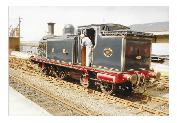
Caledonian 0-4-4T at Bo'ness in August 1989

For myself, the point wiring on Elliasville still remains to be done as other pressing work (trying to digitise some fifty years of photographic efforts) has had to take priority. However, the joy of this type of endeavour is that you uncover those hidden gems you took, looked at, put in a box and forgot about (See below). All I'll say is thank the stars for modern digital cameras that record just about everything about the picture, apart from the title that is!